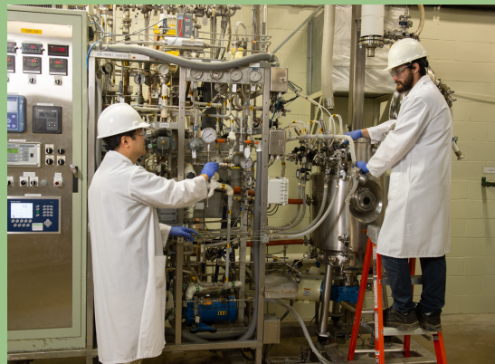
Fermentation Suite 30L, 40L, 100L, 150L, 1500L