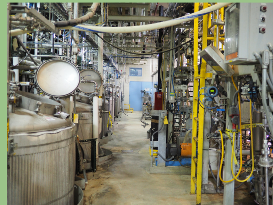
Pilot Plant 22,000L

NCERC's self-funded business model is sustained through contractual research in our three research laboratories that range from bench to demonstration scale. Through collaboration with companies in the private business sector, NCERC's research projects range greatly in scale, size, and scope, making it the perfect training ground for future researchers who want to start their careers by working on cutting-edge technologies.